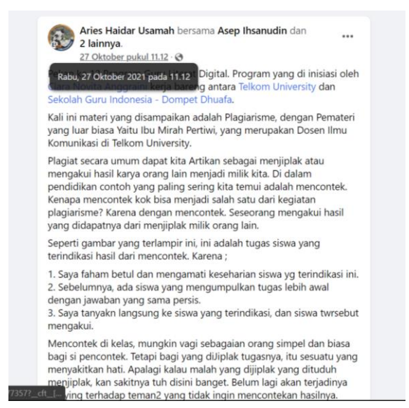
Picture 2. Reflection on the verification of plagiarism works uploaded on social media

Then, on the ability to evaluate plagiarism works, most teachers can recognize plagiarism from inconsistency in language style, sentence structure, and understanding of the topic: the language used is too complicated; not by the level of students; can be found in search engines; and lack of citations. The teachers are not familiar with the use of plagiarism detection applications such as Turnitin or Ithenticate. Teachers who do not meet the achievement of learning objectives for plagiarism material are participants who do not actively participate in webinars and also do not do the assignments.