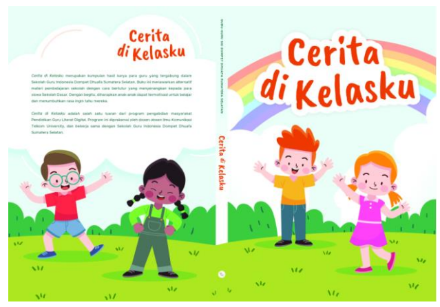
Picture 3. Book cover of a collection of articles of teaching materials made by participants

Though The Time Is Tight; Love Domestic Products; Tips For Filling Water Without Overflow Even When Left Playing; Sembilang Island: The World's Bird Food Paradise; Recognizing the Dangers of Cigarettes, Alcohol, and Drugs.