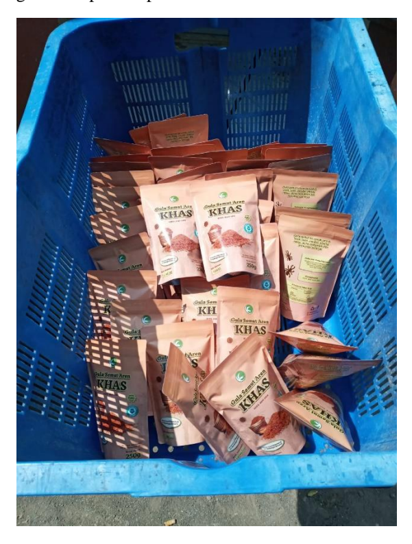
Figure 2. Finished Product

In contrast, compared to larger firms, SMEs struggle with specific obstacles to get many resources: credit loans, market frictions, knowledge capacities, and information asymmetries that cannot enable the business environment and hamper growth and productivity. Building organizations can develop well-integrated schemes for action plans, measurable objectives, and targets. Good organization can be simplified to reduce costs by expanding the production network and having a good compliance process.