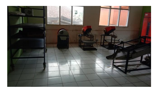
Figure 1. Production Machines

Standard practices is to provide reference and promote entrepreneurial learning, especially the challenge of isolated region. Training must strengthen coaching institutions and links, and teacher networks interested in entrepreneurial topics should be involved and encouraged. Standard practices will ensure the coaching quality of a system promoting entrepreneurial training.