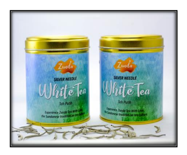
Figure 3 Design and packaging of product after rebranding, repackaging and redesigning

The number of samples identified by used of Slovin measurement as listed below: