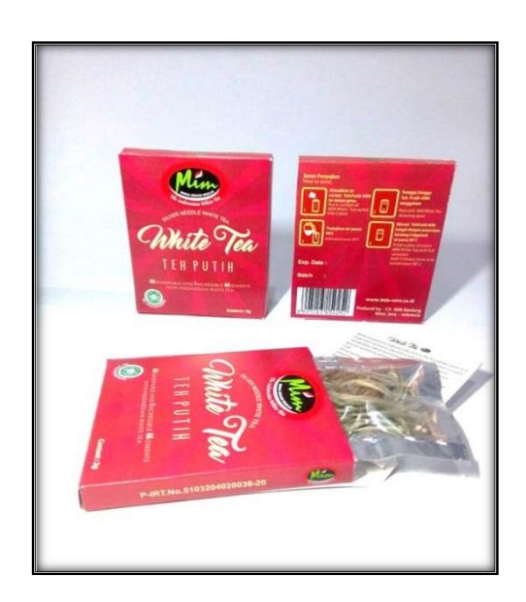
Figure 2 Design and packaging of White Tea brand

Populace inside this exploration is purchaser product: White Tea brand in Indonesia and the sample is that buyer is located in Bandung city, Indonesia. Respondent as sample in this research is a consumer of product White Tea brand in Bandung, West Java Indonesia from year of 2017. Below this is the figure of White Tea Brand packaging before and after re-package, re-design and rebranding: