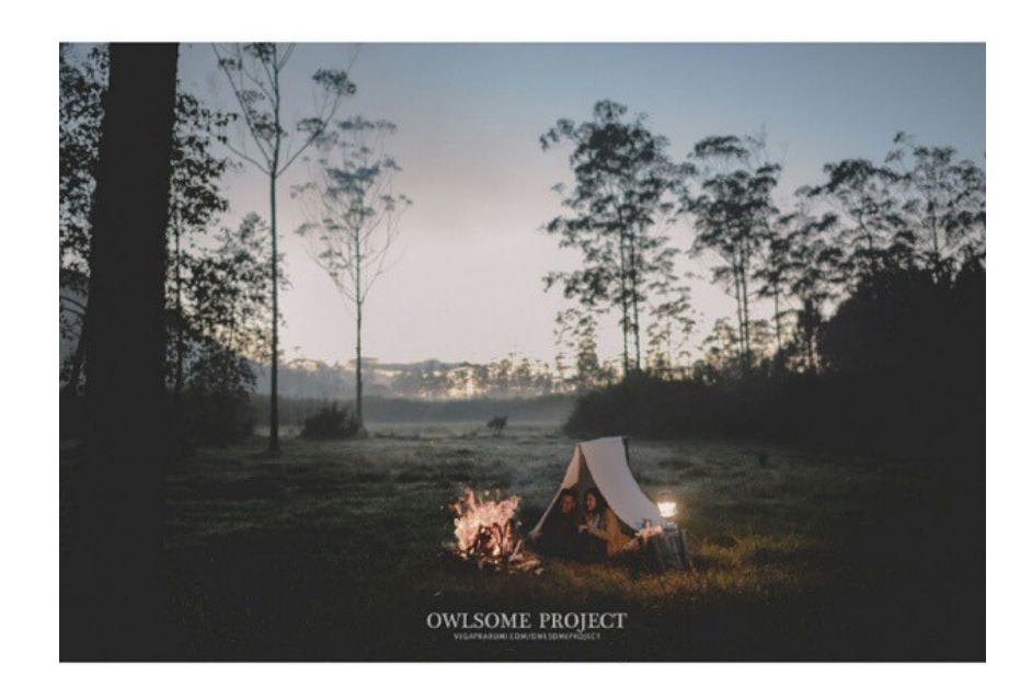
Figure 3 pre-wedding photographed by Owlsome Project Source: Instagram (@owlsomeproject), 2015

On the photo above (Figure 3), the man sits in camp, both of legs crisscross, right arm is holding a twig, laugh and staring at the bonfire. And the woman sits in camp too, both of arms hugging legs bent, laugh and staring at the bonfire. Their gestures are not showing romantic pose. Those visual signs connoted an adventurer and humorous. They wear adventurer clothes that image real adventurer. Camp and bonfire image adventurer camp. The jungle and sunset image wild, calmness, and timeless. Ami Ronnberg said that in West mythology, jungle imaged as quite, mysterious, bound, resting place, greatness, growth, timeless and life balance. In many mythology of some culture (Aborigine, West, and Egypt), sunset is the end of life (Hereafter portal opening) into eternal afterlife (Ronnberg, 2010).