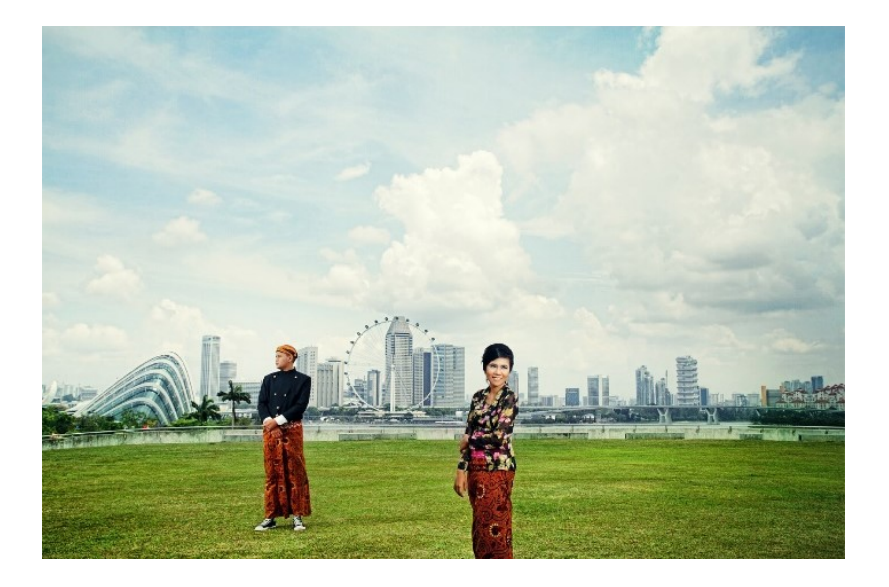
Figure 4 pre-wedding

The man is standing behind the woman, with leg straight and open, left hand holding right arm in front stomach, starring far to right of him. Those visual signs connoted dashing, serious, and cool. The woman is standing in front of the man, body position is slightly tilted to right of her, left hand holding right hand that straighten, smile and starring to left of her. Those visual signs connoted shy and graceful. They wear Javanese traditional clothes that imaged Javanese traditional people. But, the man's Converse sneaker imaged urban casual teenager. The backgrounds are futuristic buildings those image metropolis.