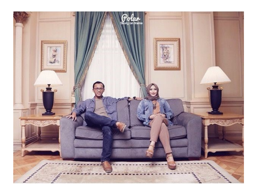
Figure 2 pre-wedding

The man sits on sofa, smiling to camera, right arm is on the armrest, left arm is straight on backrest, right leg cross on left leg. Those visual signs connoted relax, protect, and masculine. The woman sits on sofa, smiling to camera, both hand cross on thigh, left leg cross tight on right leg. Those visual signs connoted relax, graceful, and feminine. Although they sit on same sofa, there is a distance between them.