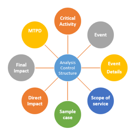
Figure 1 Control Analysis Model

Based on the business impact analysis, the four services are the focus of process risk analysis. By using risk analysis by presenting the analysis using the following Figure 1.