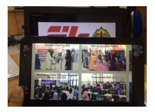
Figure 3 Displaying of Video Menu of Activities at FTIK USM

The implementation of the display of android augmented reality 3D application to identify logo and animation video and information media using marker less method is shown in Figure 3 below.