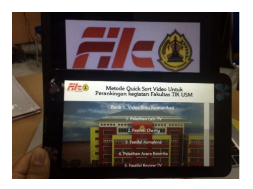
Figure 5 Sorting the Result of Quick Sort Method

In the menu of Quicksort method below, it will be sorting the ranking of activities, every activity in the faculty of Information and Communication Technology. The most number of activities will be in the first ranking and so on in Figure 5.