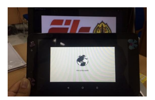
Figure 4 Playing Video of Activities at FTIK USM

Figure 4 below shows when we select one of the videos then the screen will play the video of the activities.