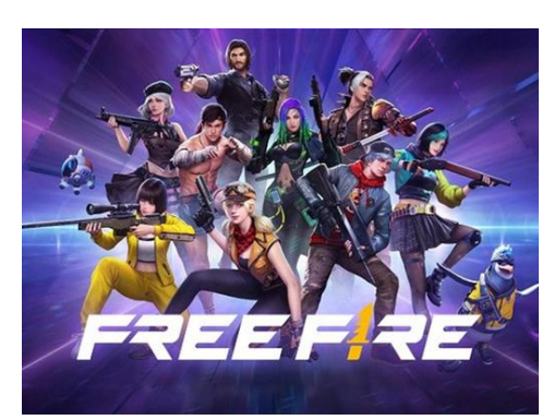
Image 1. Display of the Free Fire game on the Google Play Store page

According to Agustina (2015: 2) "Games are a way of learning by analyzing with a group of players or individually by using rational strategies". Also according to Masya & Candra (2016) the game itself has addictive properties that can affect a child's psychology. The game will not have a negative impact or significant influence on the child's psyche if the child plays it wisely and is always under the supervision of parents. Even though the game itself has a positive impact, it does not affect a child's mental health if used effectively and appropriately. psychology. Free Fire Online is a complex action-adventure battle royale game where players choose the desired character, weapon, and location according to the level of play and can play at the same time because it is connected to the internet network.