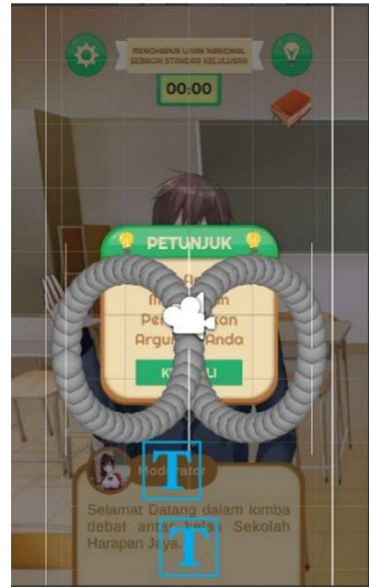
Figure 4. Obstacle track

Testing the Bézier Curves Algorithm is a function test related to the use of the Bézier Curves algorithm in forming trajectories in the debate game. The results of the implementation and testing of the Bézier Curves algorithm can be seen in the image below: