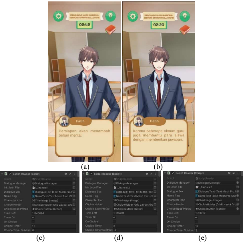
Figure 5. (a) Nervous animation, (b) confused animation, (c) normal choice time, (d) reduce choice time, (e) add choice time

The image is the result of testing the nervous animation state on the NPC where the NPC will show an anxious facial expression when the player chooses the right counter argument. The image on the right is the test result of the confused animation state on the NPC where the NPC will show a confused facial expression when the player chooses an incorrect reply to argument.