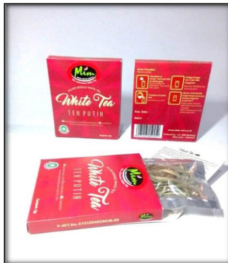
Figure 2 Design and packaging of White Tea brand

Populace inside this exploration is purchaser product: White Tea brand in Indonesia and the sample is that buyer is located in Bandung city, Indonesia. Respondent as sample in this research is a consumer of product White Tea brand in Bandung, West Java Indonesia from year of 2017. Below this is the figure of White Tea Brand packaging before and after re-package, re-design and re-branding: