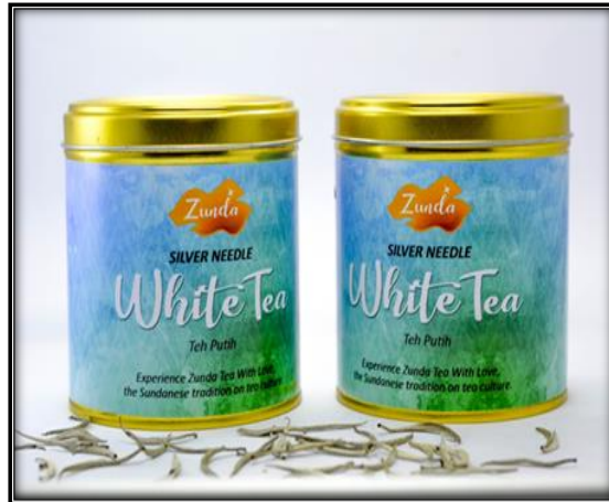
Figure 3 Design and packaging of product after rebranding, repackaging and redesigning

The number of samples identified by used of Slovin measurement as listed below: