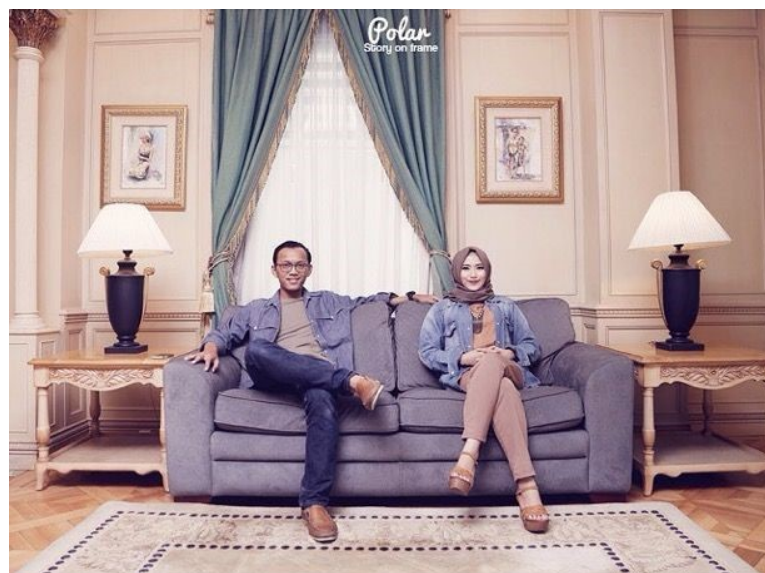
Figure 2 pre-wedding

The man sits on sofa, smiling to camera, right arm is on the armrest, left arm is straight on backrest, right leg cross on left leg. Those visual signs connoted relax, protect, and masculine. The woman sits on sofa, smiling to camera, both hand cross on thigh, left leg cross tight on right leg. Those visual signs connoted relax, graceful, and feminine. Although they sit on same sofa, there is a distance between them.