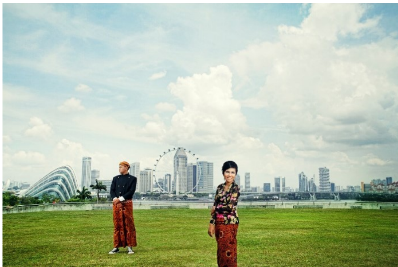
Figure 4 pre-wedding

The man is standing behind the woman, with leg straight and open, left hand holding right arm in front stomach, starring far to right of him. Those visual signs connoted dashing, serious, and cool. The woman is standing in front of the man, body position is slightly tilted to right of her, left hand holding right hand that straighten, smile and starring to left of her. Those visual signs connoted shy and graceful. They wear Javanese traditional clothes that imaged Javanese traditional people. But, the man's Converse sneaker imaged urban casual teenager. The backgrounds are futuristic buildings those image metropolis.