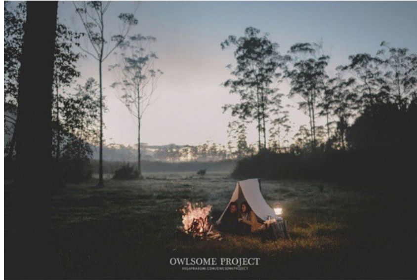
Figure 3 pre-wedding photographed by Owlsome Project Source: Instagram (@owlsomeproject), 2015

On the photo above (Figure 3), the man sits in camp, both of legs crisscross, right arm is holding a twig, laugh and staring at the bonfire. And the woman sits in camp too, both of arms hugging legs bent, laugh and staring at the bonfire. Their gestures are not showing romantic pose. Those visual signs connoted an adventurer and humorous. They wear adventurer clothes that image real adventurer. Camp and bonfire image adventurer camp. The jungle and sunset image wild, calmness, and timeless. Ami Ronnberg said that in West mythology, jungle imaged as quite, mysterious, bound, resting place, greatness, growth, timeless and life balance. In many mythology of some culture (Aborigine, West, and Egypt), sunset is the end of life (Hereafter portal opening) into eternal afterlife (Ronnberg, 2010).