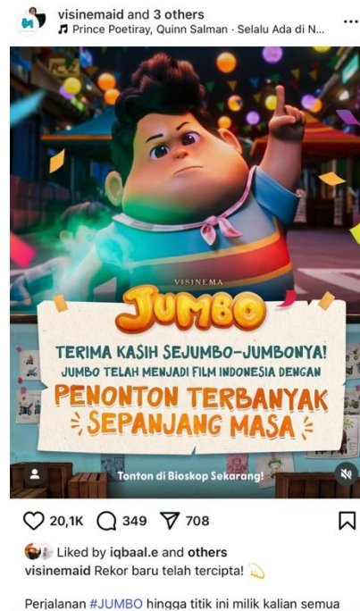
Figure 1. Visinemaid Instagram Post

This surge was driven by digital public engagement, which, through the hashtag #NontonJumboLagi, formed a collective movement to rewatch the film. The hashtag was not merely an invitation but also a means of mobilization based on nostalgia and symbolic competitive spirit, particularly to surpass the record for the highest number of viewers for a box office film in Indonesia. The #NontonJumboLagi movement was first voiced by a Twitter/X account that explicitly stated its goal of surpassing Indonesia's box office audience numbers by obtaining more than 1,600 reposts, 10,000 likes, and 123 replies.