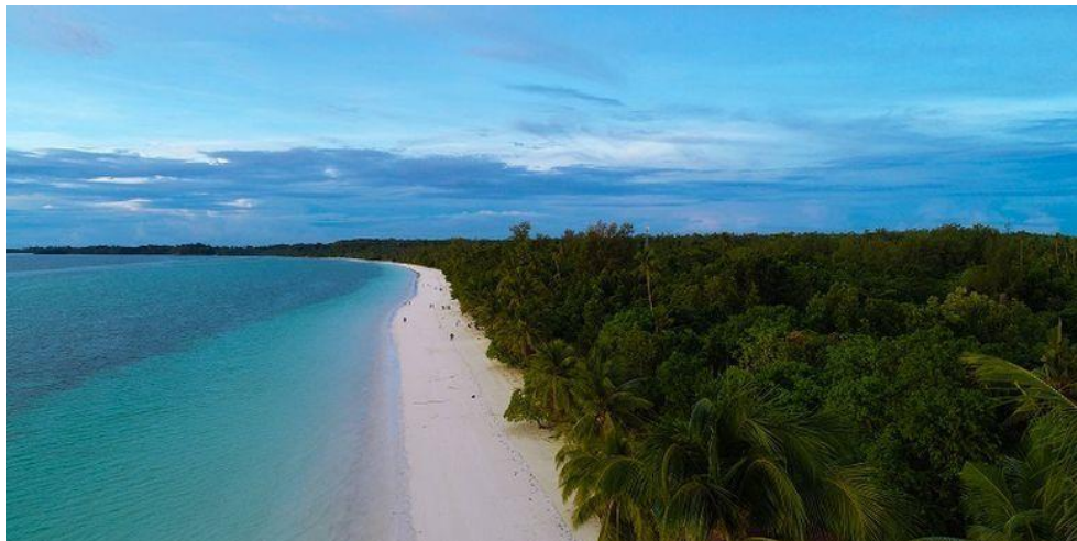
Fig 1. Study Location Ngurbloat Beach

The location of this study is on Ngurbloat Beach where beach resort and restaurant is located. Also known as Pasir Panjang Beach, is a stretch of sand that can be found in Ngilngof Village, which is around 17 kilometers away from Langgur City. The beach that presents not only the beauty of the beach panorama with its blue sky, friendly waves, super clear and blue sea water, and coconut trees that frame this place perfectly, but also because the beach sand is as fine as flour, which eventually led to Ngurbloat Beach becoming the owner of the world's first finest beach sand. In addition, there is a wide variety of marine life right in front of Ngurbloat Beach for those of you who are fans of scuba diving and want to take in the breathtaking underwater scenery of this beach, which is a tourism symbol in Southeast Maluku. The Kei language gave us the phrase "Ngurbloat," which literally translates to "Long Sand" (Figure 1).