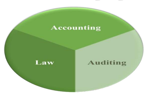
Forensic Accounting Diagram

Forensic accountants have been known in the accounting profession a few years ago primarily