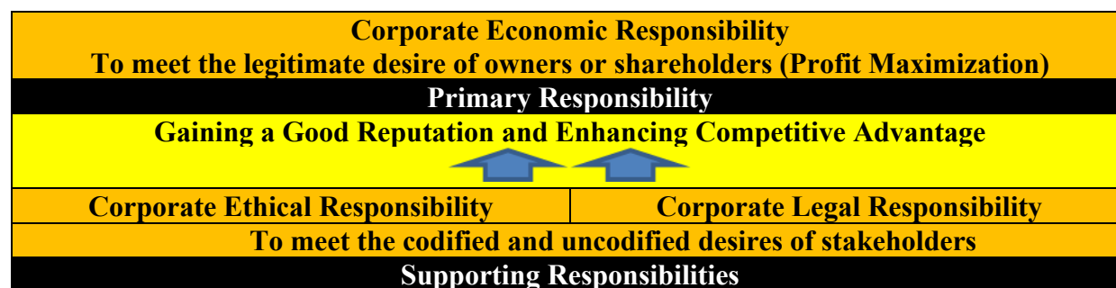
Figure No. 2: Primary Responsibility and Supporting Responsibilities

Corporate economic responsibility, which means maximizing profit, is the responsibility that reflects the legitimate desire of the owners or shareholders. Economic responsibility is considered the primary responsibility because without this desire, there would be no companies in this existence. In the modern era, companies cannot fulfill their economic responsibilities unless they adhere to their other responsibilities (legal and ethical). Legal and ethical responsibilities can be viewed as supporting responsibilities to economic responsibility. Corporate economic responsibility (profit maximization) depends primarily on legal and ethical responsibilities. This relationship is visualized in Figure 2 . The company's commitment to its legal and ethical responsibilities contributes to enhancing its reputation and competitive advantage, thus enabling it to achieve its goal of "maximizing profit."