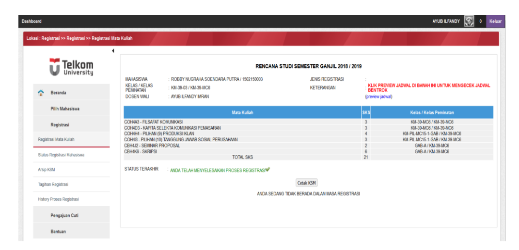
Figure 2: iGracias Internal Features

Since its initiation, Igracias has gone through numerous improvements and modifications along the years such as, inclusions of new features, layout designs, and addition of new dashboard. Despite its apparent functions and benefits, iGracias has also shown several technical and practical issues over the years. Users' complaints regarding its stability of access, ease of use, and missing features has created hindrances on its development. Such problems are felt even more by students who are still on the learning process or yet to use the system. Therefore, the most challenging aspects faced by the system developers is to maximize the acceptance and mastering of this application among the newly intake students in every academic year.