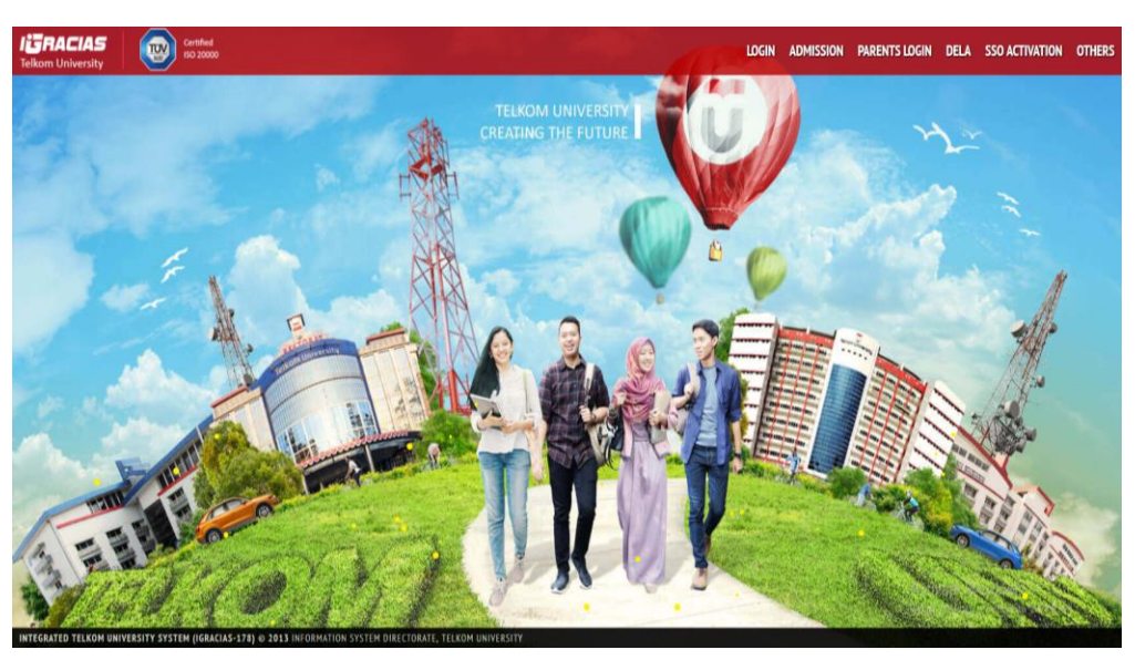
Figure 1: iGracias Login Page

Telkom University, one of the digitally advanced private campus, has developed a very comprehensive system called iGracias to manage various activities of their institutional members. IGracias, abbreviated from Integrated Academic Information System, was developed in order to computerize and to digitalize numerous academic related activities to ensure its efficiency. With a Single Sign On (SSO) feature, iGracias provides a user friendly system which enables its users to perform various academic functions, such as, course registration, academic status, scheduling, communicating, and dissemination of news. The usage of iGracias has proven its benefits for both lecturers and students, hence optimize the efficiency of their academic performance.