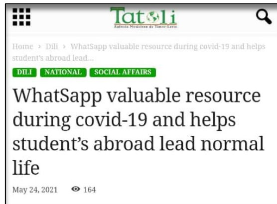
Figure 2 WhatsApp valuable resource during covid-19