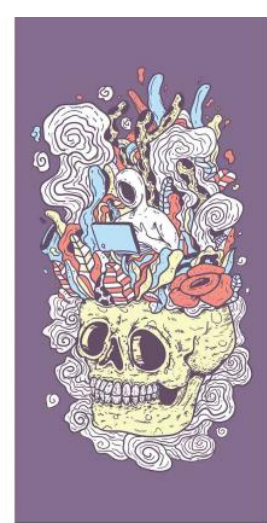
Figure 4. Finalizing Process