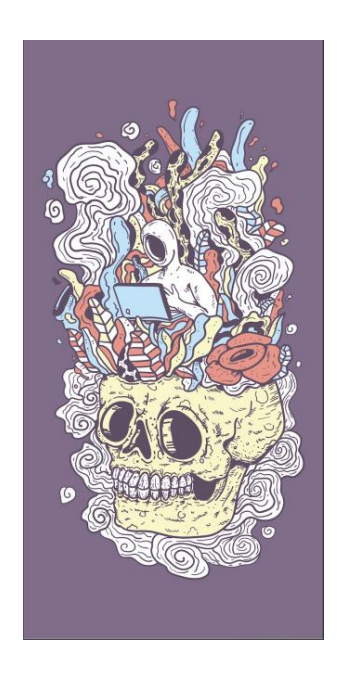
Figure 4. Final Artwork