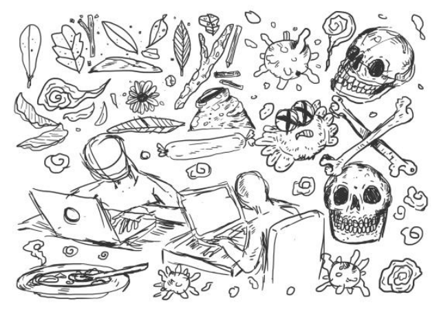
Figure 2. Visual Study of Key Concept Implementation

At this stage, we applied several key concept of the work to be developed visually. The key concept is the result from the brainstorming. Each of every key concept will be developed separately and combined at the final stage. Firstly, for the key concept of nature we conducted several visual studies, this includes incorporating keywords of the phenomenon, in this case we came into conclusion of the keywords are: fear, death, psych, survive, food, instinct and nature. Death is the core of the phenomenon, people are trying to avoid death which at the time is often portrayed as the result of infection from the virus. Psych is the mechanism triggered the actions from people to avoid pain or to keep pleasure on their side. Survive is also the mechanism to avoid pain and death which is what most people do in response to the phenomenon. Food is the object that people seek in order to survive, this is what drives people to keep working eventhough the situation is uncanny. Instinct is basically the core of the personality dynamics which coined by Sigmund Freud, it's the Id and the Ego in the psychical form this keyword is also correspond to the keyword of nature which suggested that instinct is the natural mechanism of human. From these keywords, the sketches were developed based on the intuition, therefore it's more spontaneous, and immediate, this is also based on the theoretical study findings. The following is several visual study for each of every key concept.